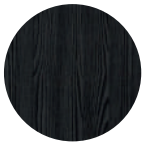
Fresno negro Black Ash