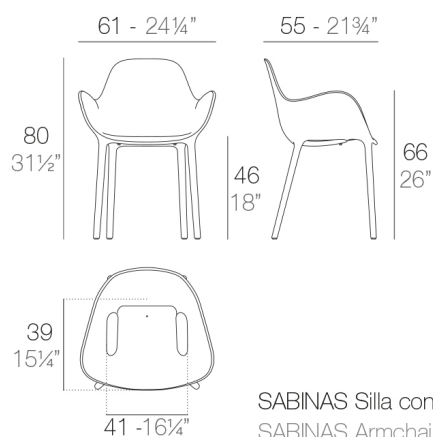
SABINAS Silla con brazos SABINAS Armchair