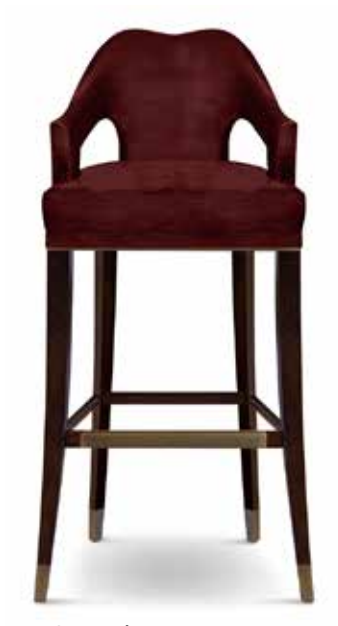
Nº 20 | BAR CHAIR

CASEGOODS UPHOLSTERY LIGHTING RUGS ART ACCESSORIES